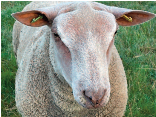
Stock Ram, Lot 151 23VDL00459