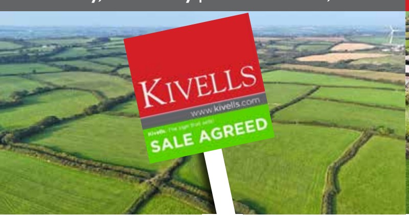
Some 29 acres of pasture land in a quiet rural, yet accessible location. Further land avilable as Lots I & 3.

Holsworthy Farms & Land Agency Farms@kivells.com | 01409 259547