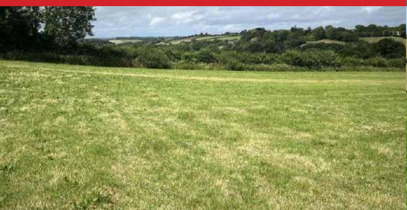
A block of approx. 19.14 acres of peacefully located pretty pasture and woodland, gently sloping and in three good sized enclosures with a natural water supply. Holsworthy Farms & Land Agency

Just under 35 acres of productive pasture and arable ground in a sought after farming area with road frontage and access and far-reaching views as far as Lundy Island. Holsworthy Farms & Land Agency Farms@kivells.com | 01409 259547