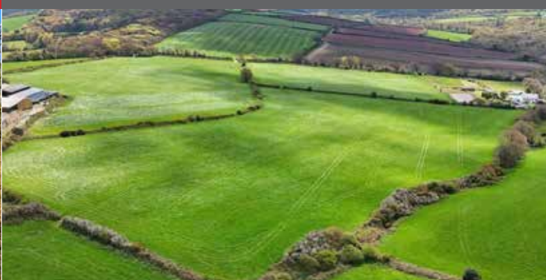
Approx. 57 acres of productive pasture land, gently sloping and south facing. Locacted in a rural location with stunning views, road frontage and access and natural water available. Holsworthy Farms & Land Agency